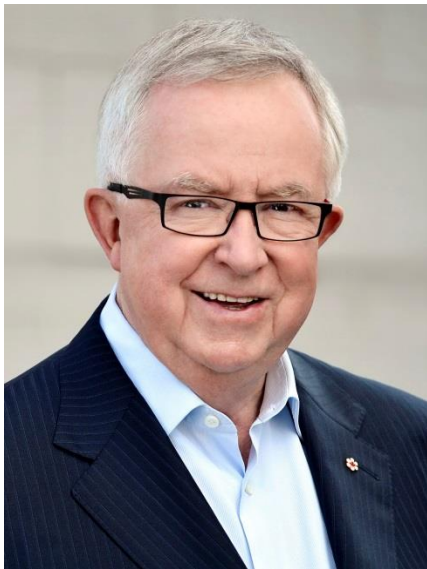
Right Honourable Joe Clark