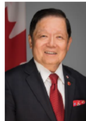
The Honourable Victor Oh Senator - Ontario